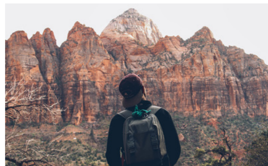
Patch 1.04 Split Second Velocity Pc